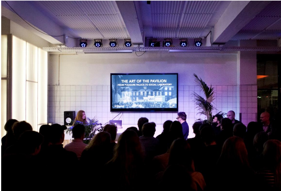
CHART TALKS March 2016